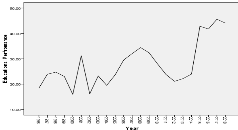
Figure 2 shows the line graph for educational performance. The line graph has been increasing from the year 1996 to 2018. In the period of 1996 to 2005, the performance is very low. After the end of armed conflict and advent of federal government, the result is comparatively higher for next three years up to 2008 and goes downwards up to 2012 and again turns upward. The line graph has inclined upwards at higher degree from the year 2015 that might be the criterion changed from scoring to grade point.

Lines Graph for Educational Performance across the Years from 1996-2018